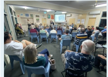
Residents attended the public meeting concerning the Wellness Centre proposal