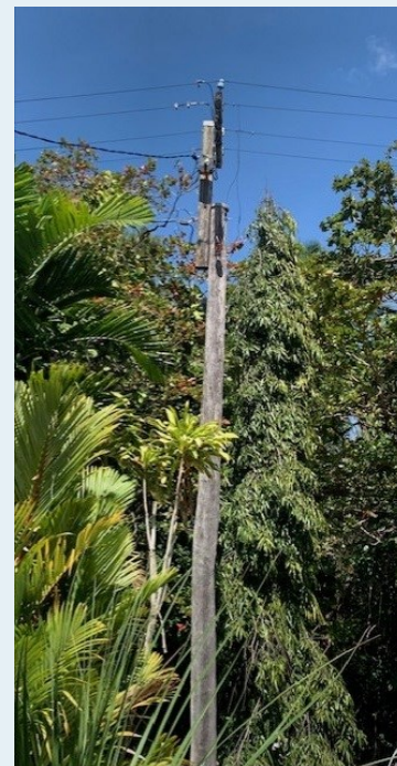
The reliability of our power supply is being examined