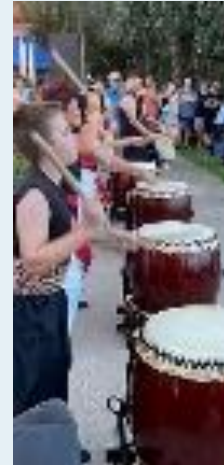
The popular Japanese Drummers are expected to return this year for the Twilight Christmas Markets