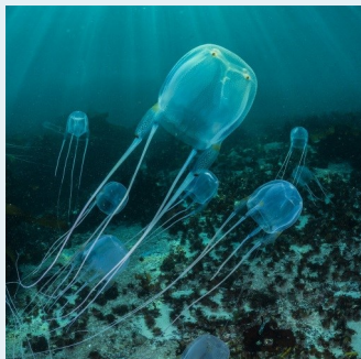
Australian Box Jellyfish